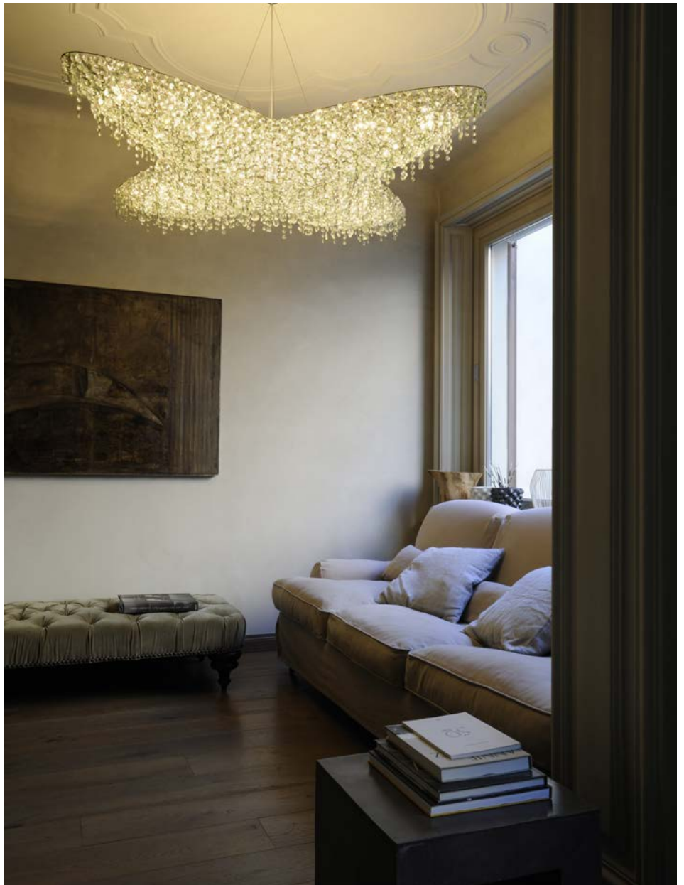
in the picture Ugolino X 180

Via Fratelli Vivarini 7, I-20141 Milano, Italy tel +39 02 895 023 42 fax +39 02 895 409 74 info@lollimemmoli.it www.lollimemmoli.it